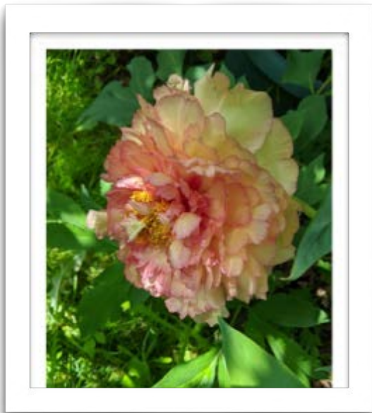
Tree Peony: Souvenir de Maxime

Such a variety of topics to share and the feedback is uplifting for the contributor. And it has prompted other sharing; eg. a daily chuckle is shared to keep up our spirits.