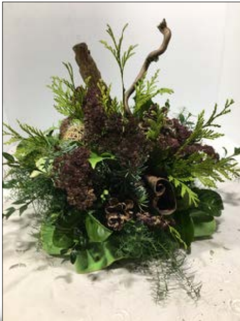
Exhibit by Mary Openshaw.

Our gardening world has definitely altered as we Zoom to stay connected for meetings and show off our creations via social media platforms.