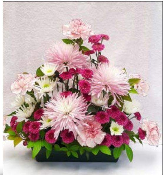
Exhibit by Bev Sass.