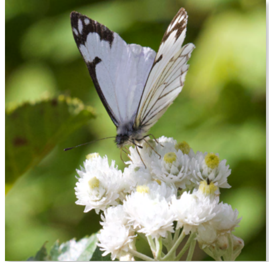
Pine White on Pearly Everlasting Dakota Bowl.

Red Flowering Currant ( Ribes sanguineum ) Canada Goldenrod ( Solidago lepida ) Douglas Aster ( Symphotrichum subspicatum ) Woodland Strawberry ( Fragaria vesca ) Kinnikinnick ( Arctostaphylos uva-ursi ) Pearly Everlasting ( Anaphalis margaritacea ) Western Yarrow ( Achillea millefolium ) Woolly Sunflower ( Eriophyllum lanatum ) Low Oregon Grape ( Berberis nervosa ) Tall Oregon Grape ( Berberis aquifolium ) Common Camas ( Camassia quamash ) Sea Blush ( Plectritis congesta ) Red Columbine ( Aquilegia formosa ) Gumweed ( Grindelia stricta ) Broadleaf Stonecrop ( Sedum spathulifolium ) Mock Orange ( Philadelphus lewisii )