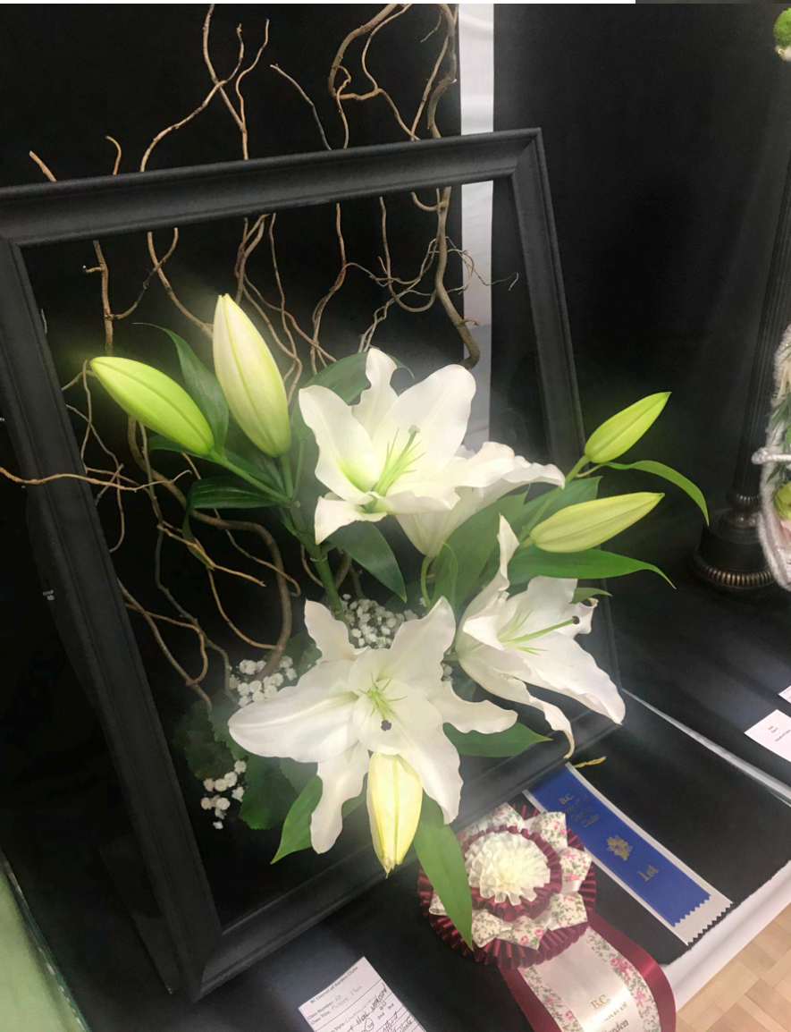
"Honourable Mention" Sandra Froese