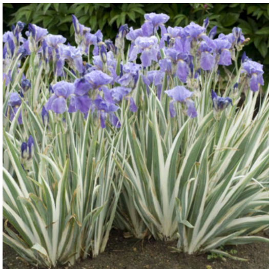
Iris pallida 'Albo Variegata'