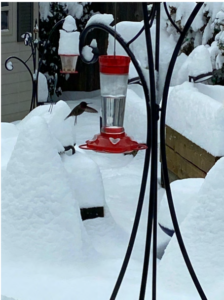
Lissa McCulloch, Capilano Garden Club, North Vancouver