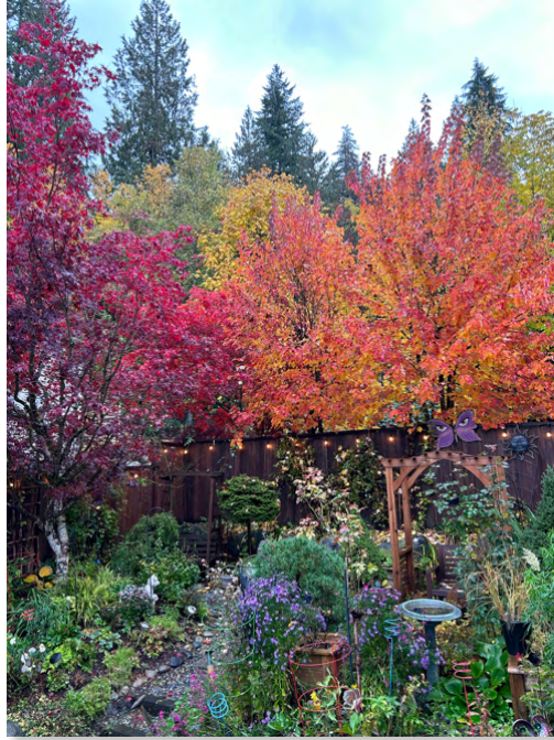
Val Bouillet, Maple Ridge Garden