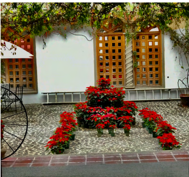
Poinsettias, Antigua, Guatemala