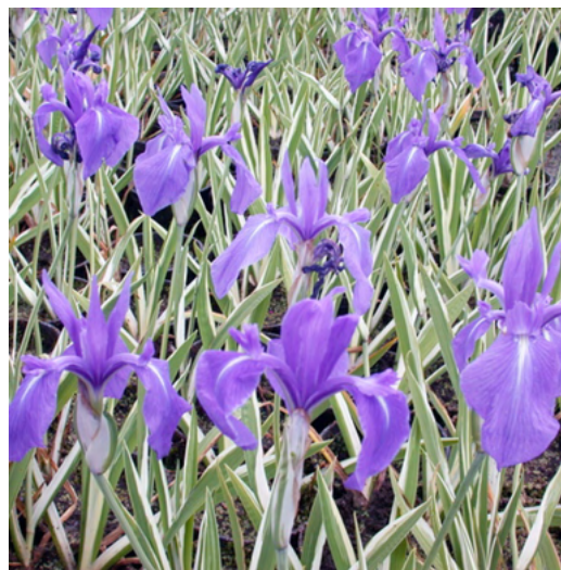
Iris ensata 'Variegata'