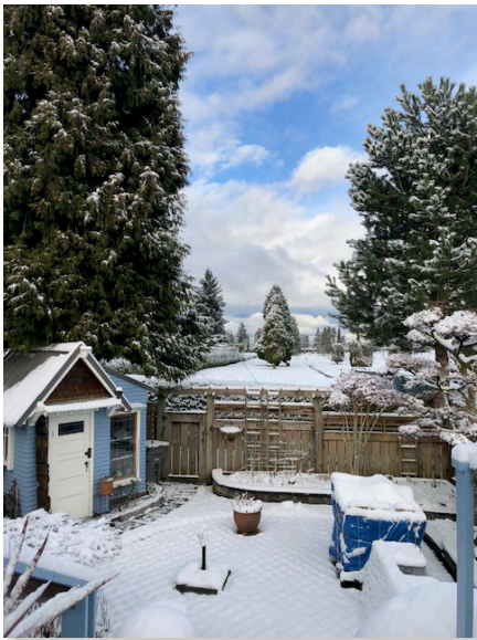
Bonnie Friesen, Seed to Sky, Vancouver