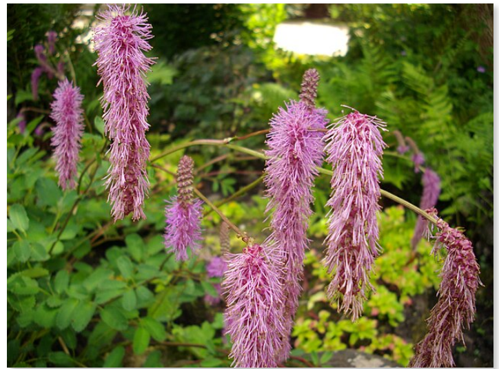
Sanguisorba obtusa, Japanese burnet.