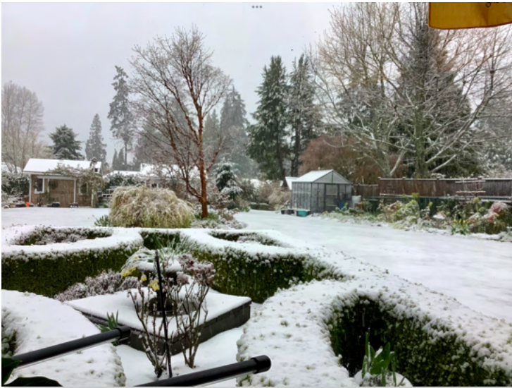
Shelley Seniuk, Nanoose Bay Garden Club