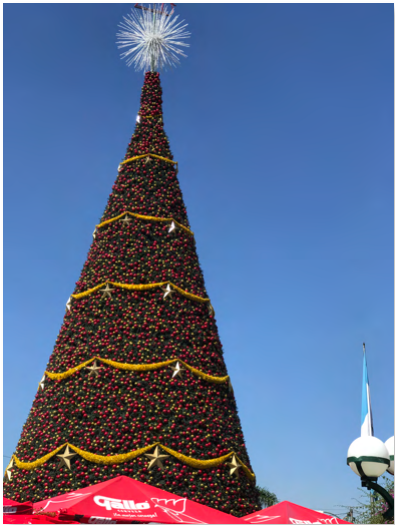
Christmas tree, Guatemala City