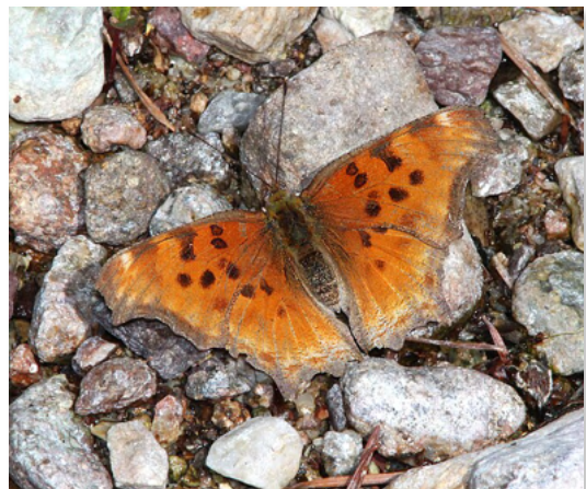
Satyr comma

The satyr comma pupae are tan or straw coloured and sometimes yellowish on the back. The projection in the middle of the back of the thorax, and the projections in a row down the back of the abdomen, are much taller than in our other anglewings.