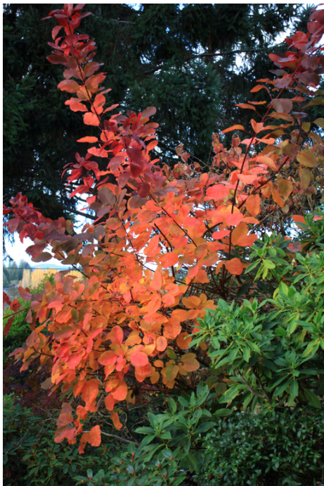
Linda Derkach, Qualicum Beach Garden Club

To listen to the interview: https://www.cbc.ca/listen/live-radio/1-91/clip/16022687 https://www.cbc.ca/listen/live-radio/1-91/clip/16022687